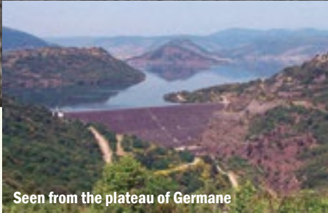
Seen from the plateau of Germane