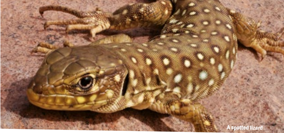
A spotted lizard