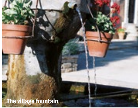
The village fountain