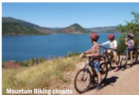
Mountain Biking circuits

The lake Salagou is the perfect place for mountain biking, with many circuits for all the family. Marked circuit hiking trails of 1-4hrs with different levels of difficulty will allow you to discover the diversity of the landscapes of the Salagou and the Cirque de Mourèze. Other sporting activities are also available on the lake Salagou such as: windsurfing, canoeing, sailing or pedal boating and in the surrounding area there is paragliding and rock-climbing. Fishing is authorised if you have a licence, however, thermal-powered boats are prohibited. Outdoor sporting facilities can be found on the shores on the Clermont side and the hamlet of the Vailhés on the Lodève side. In the summer, horse trekking and the rental of mountain bikes is possible.