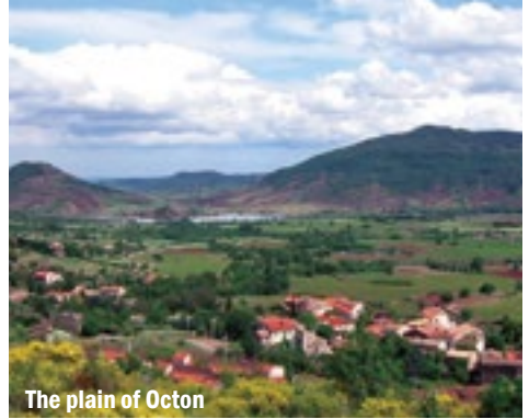
The plain of Octon

Before the filling of the lake Salagou, the plain was used for agriculture and animal grazing. The landscapes were different; the valley of the Salagou had been shaped according to agricultural development and the way of life. After the filling of the water, agriculture had to adapt and change to this new environment. It is still possible to see ancient dwellings, capitelles in Occitan, dry-stone shelters that were used by shepherds and peasants in days gone by. Currently, about twenty farmers live in the region of the Grand Site which allows it to pursue its destiny of old times. The wine-growing is booming too with numerous wineries and wine-making estates.