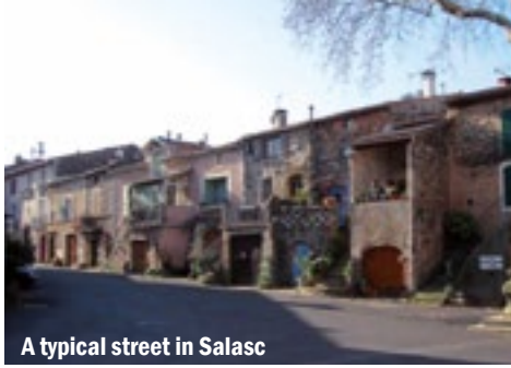
A typical street in Salasc