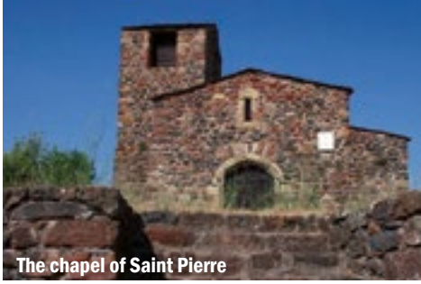
The chapel of Saint Pierre