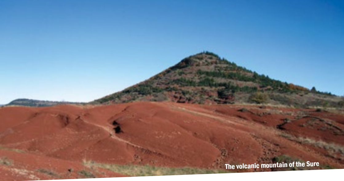
The volcanic mountain of the Sure