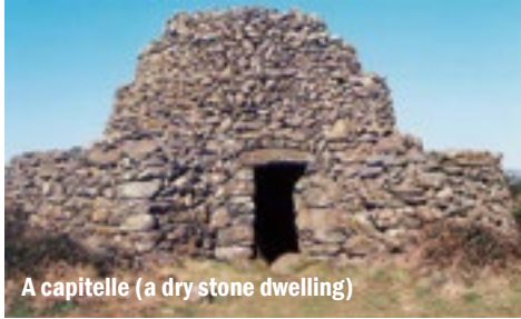
A capitelle (a dry stone dwelling)